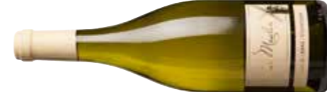
Patrick Lebas, Vieux-Moulin, Muscadet Sèvre-et-Maine 2009 91 JB 93 CK 92 BL 89

N/A UK www.martin-luneau-muscadet.fr Subtle, cool nose ushers in a beautifully composed palate that is polished yet vinous and integrated. Vivacious wine with well-judged substance, great acid lift and good length. Drink 2017-2024 Alc 12%