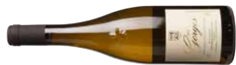
Blanchard, Muscadet Sèvre-et-Maine Gorges 2013 94 JB 93 CK 95 BL 93