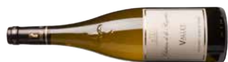
Les Frères Couillaud, Château de la Ragotière, Muscadet Sèvre-et-Maine Vallet 2012 94 JB 94 CK 92 BL 96

Toasty nose leading to an easy yet vibrant palate that dances across the tongue with a wonderfully fresh burst of minerality and juicy citrus fruit – superb. Drink 2017-2025 Alc 12%