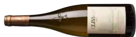
Cyrille et Sylvain Paquereau, Muscadet Sèvre-et-Maine Clisson 2013 94 JB 93 CK 92 BL 96

A leesy, polished, richly fruited nose ushers in a creamy, toasty yet fresh palate with a mineral vein persisting through to a long finish. Impressive, and will gain more with further age. Drink 2017-2028 Alc 12.5%