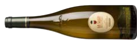
Guilbaud Frères, Le Clos du Pont, Muscadet Sèvre-et-Maine 2009 90 JB 88 CK 92 BL 89

N/A UK +33 2 40 54 05 09 Beautifully defined floral and citrus aromas lead to a bright palate with a sappy, chalky, minerals that has a nervous energy to it. This will benefit from age although it is delicious now too. Drink 2017-2025 Alc 12%