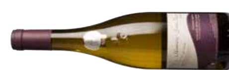
Domaine Martin, Le Rochils, Muscadet Sèvre-et-Maine Monnières St-Fiacre 2010 91 JB 88 CK 89 BL 95

N/A UK +33 2 40 54 60 58 Well-defined nose with a strong terroir vein. Then a charmingly reserved palate with fresh mineral poise and just the right amount of lees-aged texture. Delightful, elegant and energetic. Drink 2017-2024 Alc 12%