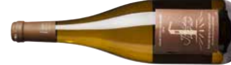
Vignerons du Pallet, Jubilation, Muscadet Sèvre-et-Maine Le Pallet 2014 91 JB 95 CK 89 BL 89

N/A UK +33 2 40 36 40 01 Restrained, smoky nose while the palate has fine weight and energy with a floral lift and a mineral backbone backed by great acidity. Still youthful. Drink 2017-2025 Alc 12%