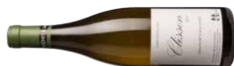
Les Bêtes Curieuses, Muscadet Sèvre-et-Maine Clisson 2013 92 JB 95 CK 91 BL 90

N/A UK www.muscadet-perraud.com Rich, evolved style from long lees ageing, with overt acacia and honeysuckle aromas. Serious, intense and beautifully textured with creamy citrus and orchard fruit wrapped around a firm mineral vein. Drink 2017-2026 Alc 13%