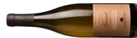
Domaine de la Chauvinière, Jérémie Huchet, Granit, Muscadet Sèvre-et-Maine Château-Thébaud 2010 91 JB 91 CK 93 BL 90

N/A UK muscadet.clavelliere.free.fr Pretty nose of peach and pineapple welcomes a precise palate with a lees evolution allied with a crunchy mineral coolness and an acid freshness that furnishes a long finish. A very good example. Drink 2017-2026 Alc 12.5%