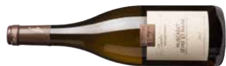
Domaine des Tilleuls, Les Quatre Châteaux Vieilles Vignes, Muscadet Sèvre-et-Maine 2013 90 JB 92 CK 89 BL 90

N/A UK +33 2 40 80 07 07 Dried pear and citrus aromas welcome a broad and rich palate with a slight wet wool note lifted by acid brightness. Finishes long – a good example. Drink 2017-2026 Alc 12%