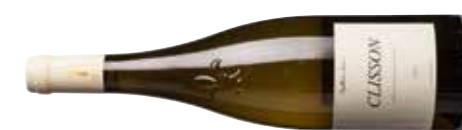
Martin-Luneau, Muscadet Sèvre-et-Maine Clisson 2013 91 JB 90 CK 94 BL 89

N/A UK domainelandelle@hotmail.fr Creamy nose with a hint of russet apple leads to a textured palate of rich fruit and a firm acid backbone. This fits out the finish with a rolling, mineral, saline length. Drink 2017-2027 Alc 12%