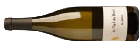
Jo Landron, Le Fief du Breil, Muscadet Sèvre-et-Maine La Haye Fouassière 2012 90 JB 91 CK 92 BL 88

N/A UK www.vallon-des-perrieres.fr Broad nose with hints of honeycomb and brazil nut. Richly textured, weighty palate with creamy honeyed fruit and a praline finish, yet not without length and finesse. Drink 2017-2028 Alc 12%