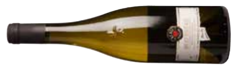
Dominique Hardy, Le Rubis de Sanguèze, Muscadet Sèvre-et-Maine Mouzillon-Tillières 2012 90 JB 94 CK 90 BL 87

N/A UK www.muscadet-sur-lie.com Fine-boned, mineral nose with a citrus hint. Zesty palate with an acid frame conferring a real sense of energy and freshness; should develop further. Drink 2018-2027 Alc 12.5%