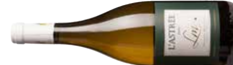
Libeau, L'Astrée, Muscadet Sèvre-et-Maine 2009 91 JB 95 CK 91 BL 87

N/A UK +33 2 40 54 05 09 Restrained but defined nose makes way for a taut, mineral-fresh palate with peach and orange zest characters peppered with mineral dust. Finishes long and pithy, with the weight to age. Drink 2017-2024 Alc 12%