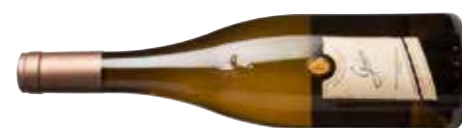
Rémy et Raphael Luneau, Domaine de la Grange, Muscadet Sèvre-et-Maine Goulaine 2012 94 JB 94 CK 94 BL 94

Intense, mineral, creamy nose then a dried orchard fruit palate of substance and depth leading to a long, charged, mineral finish. Lots of potential. Drink 2017-2028 Alc 12%