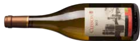
Héraud, Muscadet Sèvre-et-Maine Clisson 2012 90 JB 92 CK 87 BL 90

N/A UK www.guilbaud-muscadet.com Initially discreet nose, opening out to reveal preserved fruit and a little white truffle, with the palate offering texture, freshness, decent weight and substance. A robust style but with energy and form. Drink 2017-2025 Alc 12.5%