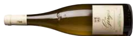
Vignoble Barreau, Domaine de la Cornulière, Muscadet Sèvre-et-Maine Gorges 2014 94 JB 96 CK 95 BL 90

Minerally, expressive lemon aroma. Beautifully poised and elegant palate of real polish and gentle minerality. Fresh and pure, with a lively mouthfilling texture. Drink 2017-2028 Alc 12%