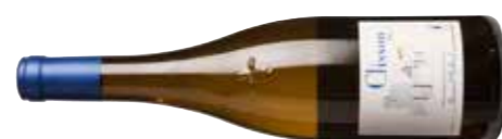
Bernard Maillard, Muscadet Sèvre-et-Maine Clisson 2013 93 JB 90 CK 95 BL 93

Delicate, expressive nose of green pear while the palate boasts an exquisite light-footed attack, though with no lack of energy and lift. Long, mineral finish. Drink 2017-2026 Alc 12%