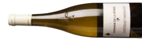
Domaine de la Pépière, Muscadet Sèvre-et-Maine Château-Thébaud 2012 93 JB 91 CK 95 BL 93

Smoky nose with toasted almond hints, then a substantial, polished palate of dried peach and apricot with a mineral bass note and fresh acidity. Really long. Drink 2017-2030 Alc 12.5%