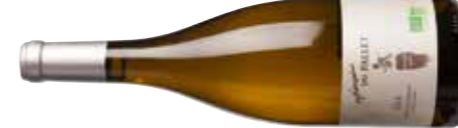
Michel Bedouet, Expression du Pallet, Muscadet Sèvre-et-Maine 2014 93 JB 94 CK 93 BL 91

Evolved nose of truffle, dried fruit and honey leads to an opulent palate showing the weight of the vintage, though with still fresh acidity and fine minerality. Drink 2017-2026 Alc 13%