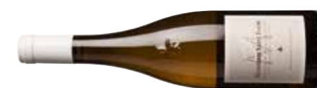
Véronique Günther-Chéreau, Muscadet Sèvre-et-Maine Monnières St-Fiacre 2013 93 JB 90 CK 94 BL 96

Expressive notes of wild flowers, greengage and bergamot. Beautifully defined palate with vigorous acidity and a bright, clean, long finish. Drink 2017-2027 Alc 12%