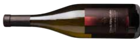
Charpentier Fleurance, Clos du Pâtis d'Enfer, Muscadet Sèvre-et-Maine 2012 94 JB 97 CK 93 BL 91

A crunchy, saline nose expanded by a little dried citrus fruit. The palate has real elegance, with a charming layer of peach and lychee leading to a mineral-charged finish. Refreshing and engaging. Drink 2017-2027 Alc 12%