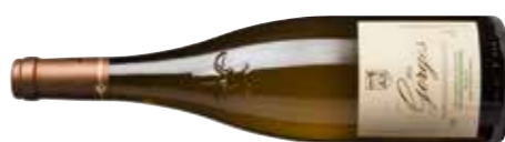
Auguste Bonhomme, Muscadet Sèvre-et-Maine Gorges 2014 93 JB 93 CK 94 BL 92

Elderflower and nettle heightened by fine minerality. Breezy, elegant yet mouthfilling. Long, vibrant finish. Drink 2017-2026 Alc 12%