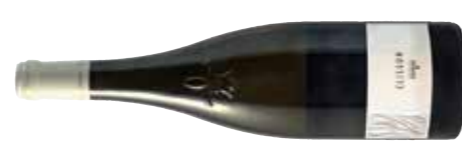
Domaine de la Pépière, Muscadet Sèvre-et-Maine Clisson 2014 92 JB 92 CK 93 BL 92

POA Les Caves de Pyrene Opulent, smoky nose leads to a compact palate showcasing a polished and rich patchwork of citrus fruits and sea salt, remaining bright and fresh throughout. Will continue to age well. Drink 2019-2027 Alc 12%