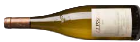
Gilles Luneau, Muscadet Sèvre-et-Maine Clisson 2013 90 JB 89 CK 89 BL 93

N/A UK www.dhardy.fr Aromas of dried lemons and berry leaf unveil a light-framed though composed palate with a gentle lemon fruit substance. Pleasant and well thought out. Drink 2017-2030 Alc 12%