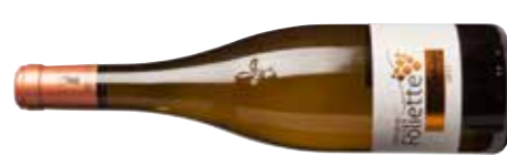
Domaine de la Foliette, Muscadet Sèvre-et-Maine Goulaine 2013 92 JB 91 CK 93 BL 92

N/A UK www.domainedeguerande.com Energetic, appealing nose of zesty citrus fruit, while the palate manifests a corresponding energy with fabulous fresh citrus fruit and white flowers in a tightly-wound frame. A wine of fine quality. Drink 2018-2026 Alc 12%