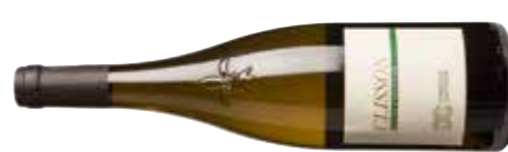
Domaine Christian Gauthier, Muscadet Sèvre-et-Maine Clisson 2012 90 JB 91 CK 88 BL 92

N/A UK www.domaine-de-la-perriere.net Fresh, bright, smoky nose while the palate reveals more of the same, with an attractive bitterness, pithy substance and cool, mineral depth. Drinking nicely now. Drink 2017-2023 Alc 12%