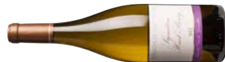
Domaine du Haut Bourg, Signature du Haut Bourg, Muscadet Côtes de Grandlieu 2012 94 JB 95 CK 96 BL 92

Expressive, open nose with notes of peach, honey, greengage and creamy lees. The palate is richly layered with defined fruit that carries to the long finish. Drink 2017-2029 Alc 12.5%