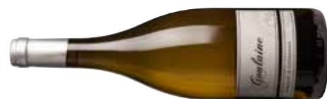
Domaine de Guérande, Muscadet Sèvre-et-Maine Goulaine 2013 92 JB 92 CK 94 BL 91

N/A UK www.chateau-briace.com Lean, mineral nose leading to a fresh, breezy palate with an appealing saline edge and plenty of energy on the long, cool, mineral finish. Drink 2017-2026 Alc 12.5%