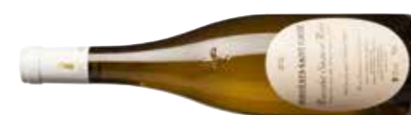
Topaze, Muscadet Sèvre-et-Maine Monnières St-Fiacre 2012 93 JB 90 CK 94 BL 95

Floral, flinty nose leads to a polished palate with a touch of dried citrus fruit partnered with a leesy influence, culminating in a lovely, breezy finish. Drink 2018-2026 Alc 12%