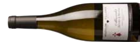
Vignobles Chéneau, Muscadet Sèvre-et-Maine Mouzillon-Tillières 2012 90 JB 87 CK 89 BL 94

£11.99 Majestic Expressive nose of white-flower and peach-skin, leading to a full, rich, vinous palate with an energetic edge keeping softness in check and ensuring a vivacious finish. Solid and well made. Drink 2017-2023 Alc 12.5%