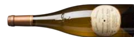
Luneau Michel et Fils, Tradition Stanislas, Muscadet Sèvre-et-Maine Mouzillon-Tillières 2003 93 JB 93 CK 92 BL 93

Very pretty nose: pure, cool and mineral with a preserved citrus note. Quite an opulent style but with a touch of zesty bitterness on the finish adding freshness, energy and lift. Offers real appeal. Drink 2017-2029 Alc 12.5%