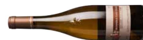
Château de La Cormerais, Muscadet Sèvre-et-Maine Monnières St-Fiacre 2013 90 JB 92 CK 94 BL 85

N/A UK www.vigneronsdupallet.com Attractive dried fruit aromas lead to a richly textured, precise, polished palate with zippy length. Drinking well now but likely to gain from further age. Drink 2017-2024 Alc 12.5%