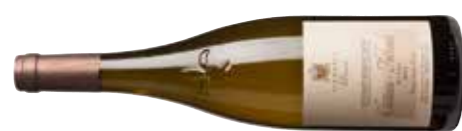
Vignoble Drouard, Les Garis, Muscadet Sèvre-et-Maine Château-Thébaud 2012 93 JB 93 CK 90 BL 97

POA Daniel Lambert Intensely smoky, mineral nose. The palate shows real evolution: dried fruit with real richness and creamy weight freshness and purity too. Drink 2017-2029 Alc 12%