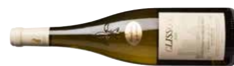
Chatellier et Fils, Muscadet Sèvre-et-Maine Clisson 2010 91 JB 88 CK 92 BL 92

N/A UK muscadet.clavelliere.free.fr Pretty nose of peach and pineapple welcomes a precise palate with a lees evolution allied with a crunchy mineral coolness and an acid freshness that furnishes a long finish. A very good example. Drink 2017-2026 Alc 12.5%