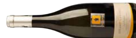
Domaine Ménard-Gaborit, Méganome, Muscadet Sèvre-et-Maine Le Pallet 2012 93 JB 95 CK 92 BL 93

Pure, precise, floral and greengage aromas. Robust palate with a chalky-mineral spine, taut but textured and a dazzling fruit and acid interplay. Drink 2017-2029 Alc 12%