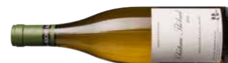
Les Bêtes Curieuses, Muscadet Sèvre-et-Maine Château-Thébaud 2009 93 JB 95 CK 92 BL 92

Toasty, brioche aromas augmented by preserved lemon. Palate of delicacy and finesse – no heavyweight but still with juicy, energetic fruit and a long, fine, pithy finish of real character. Drink 2017-2028 Alc 12%