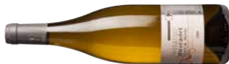
Domaine des Cognettes, Tentation de Granite et Gabbro, Muscadet Sèvre-et-Maine 2009 94 JB 96 CK 92 BL 94

Broad, classic, mineral nose while the palate exhibits a rich, bold character of grilled lemon and orange with a gentle acid lift persisting to a long finish. A lovely wine true to its origins. Drink 2017-2027 Alc 12.5%