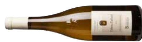
Domaine de la Bareille, Les Grands Brosseau, Muscadet Sèvre-et-Maine Château-Thébaud 2013 90 JB 93 CK 89 BL 89

N/A UK +33 2 40 54 42 91 Broad, open style with honey and toasty aromas leading to a soft yet weighty palate with an appealing purity of white peach fruit. Marked acidity endows the finish with long, pithy length. Drink 2017-2028 Alc 12%