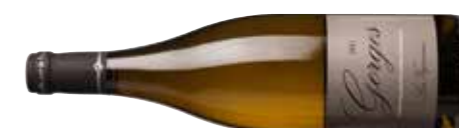
Domaine Michel Brégeon, Les Vigneaux, Muscadet Sèvre-et-Maine Gorges 2013 93 JB 94 CK 90 BL 94

Engaging lime and white flower nose, with crushed rock minerality. The palate is cool, mineral and taut with forthright acidity and a lip-smacking finish. Drink 2017-2027 Alc 12%