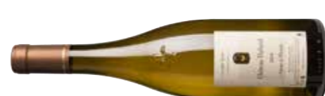
La Haute Févrie, Coteaux de L'Ebeaupin, Muscadet Sèvre-et-Maine Château-Thébaud 2014 90 JB 89 CK 92 BL 90

£41 Les Caves de Pyrene Rich exotic, waxy nose then honeyed, toasty flavours. A creamy style, but not without the required acid energy. Drink 2017-2024 Alc 13%