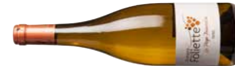
Domaine de la Foliette, Muscadet Sèvre-et-Maine La Haye-Fouassière 2010 91 JB 93 CK 90 BL 90

POA Enotria High-toned smoky nose, while the palate has freshness and zip with creamy peach and pear fruit kept in check by fresh acidity and a firm, mineral bite. Drink 2017-2026 Alc 12.5%