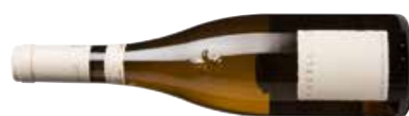
Pierre Luneau-Papin, Excelsior, Muscadet Sèvre-et-Maine Goulaine 2014 92 JB 93 CK 92 BL 90

N/A UK www.lesbetescurieuses.fr Concentrated dried apple aromas, intensified by white pepper and salt, followed by a broad, mineral palate of real energy yet still has a light texture. Drink 2017-2026 Alc 12.5%