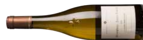
Domaine La Haute Févrie, Muscadet Sèvre-et-Maine Monnières St-Fiacre 2010 93 JB 96 CK 90 BL 94

Intense, mineral nose precedes a rich, textured palate of white flowers, peach, lychee and orange zest, leading to a substantial and mineral-charged finish. Real character here. Drink 2017-2029 Alc 12%