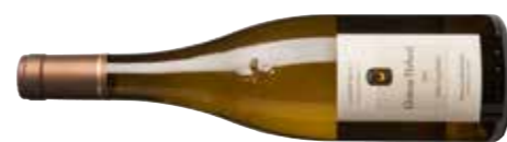
Pierre-Luc Bouchaud, Pont Caffino, Muscadet Sèvre-et-Maine Château-Thébaud 2009 92 JB 93 CK 93 BL 90

£25.99 (2013) Hedonism, Indigo Wine Pungent, mineral and intense. Fine weight and substance, with a crunchy mineral vein, as well as incisive acidity to fuel the lip-smacking finish. Drink 2018-2025 Alc 12.5%