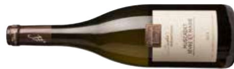
Domaine des Tilleuls, Les Quatre Châteaux Vieilles Vignes, Muscadet Sèvre-et-Maine 2014 90 JB 89 CK 90 BL 90

£15 Peter Osborne Classic, mineral nose leads to a balanced palate with just the right amount of pithy citrus fruit and mineral undertow to match pronounced acidity. Drink 2018-2026 Alc 12%